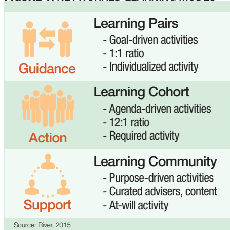
FIGURE 1: NETWORKED LEARNING MODES

What do you think? Join the discussion at tinyurl.com/redefineblendedlearning , follow us on Twitter @CL0media or join our Chief Learning Officer LinkedIn group.